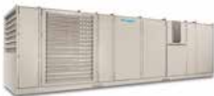
RoofPak™ outdoor air handler