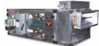
Destiny™ indoor air handler