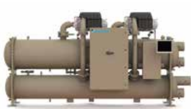
Magnitude magnetic bearing chiller