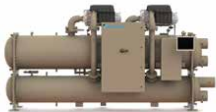
100 to 400 ton

Dual Compressors for redundancy and industry leading part load efficiency available in 100-400 ton and 800-1500 ton capacity.