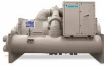
Magnitude magnetic bearing chiller