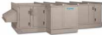
Skyline™ outdoor air handler