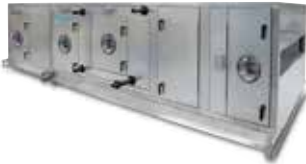
Vision™ indoor air handler