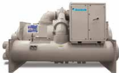
400 to 1500 ton