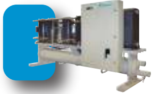
WGZ Water-Cooled Scroll Chiller 30 - 200 Tons