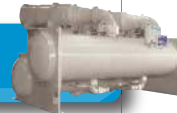
WCC Series Counterflow Centrifugal Compressor Chiller 1200 - 2700 Tons