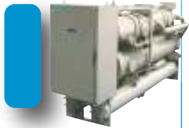
WGS Water-Cooled Screw Chiller 130 - 190 Tons