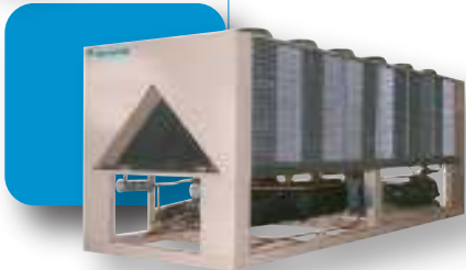
Air-Cooled Screw Compressor Chiller Model AGS • 140 - 200 RT

Remote Evaporator and Pump Package options available