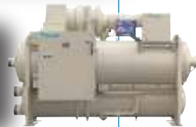
WDC Dual Centrifugal Compressor Chiller 400 - 2500 Tons