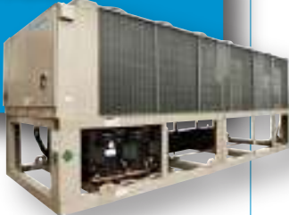
Air-Cooled Scroll Compressor Chiller Model AGZ-E • 30 - 70 RT Model AGZ-D • 75 - 190 RT

Remote Evaporator and Pump Package options available