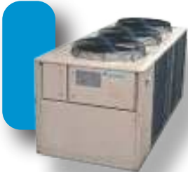
Air-Cooled Scroll Compressor Chiller Model AGZ-B • 10 - 34 RT